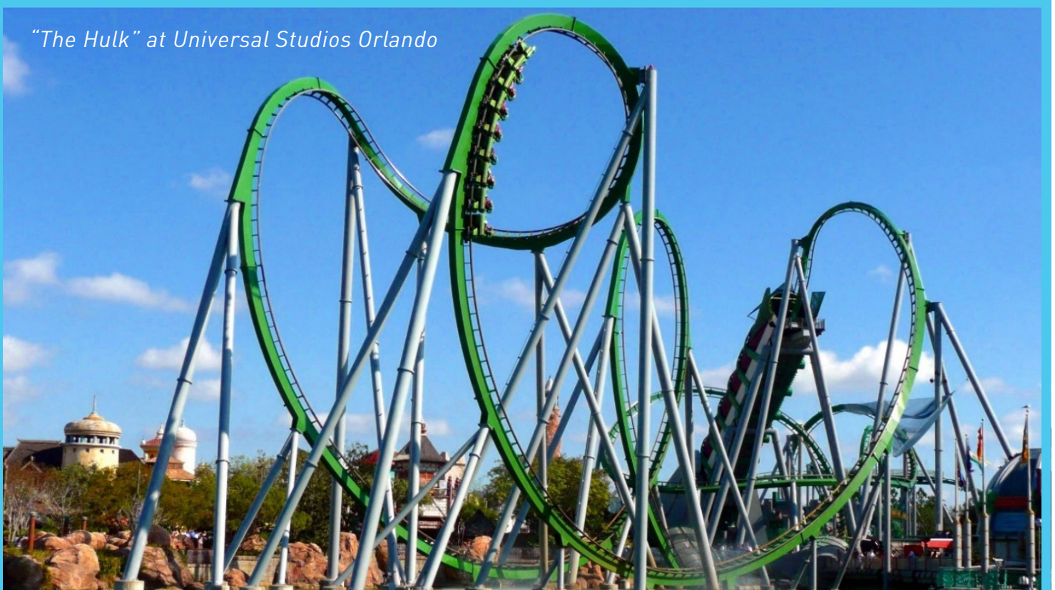
"The Hulk" at Universal Studios Orlando

Check out this popular roller coaster track. Can you pick out the spots where the track is increasing speed? How about decreasing speed?